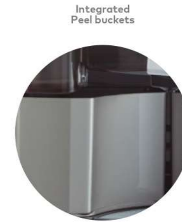
Integrated Peel buckets