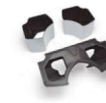
Countertop Kit Orange Silver Graphite