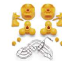
Kit S Squeezing Kit (45 - 67 mm)