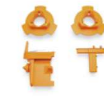
Dynamic Cutting System DCS